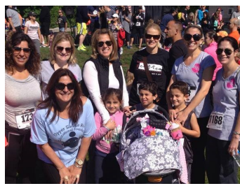
May 17th, SRVJWC supported our schools at the USREF 5k Run!