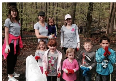
May 10th, USR Clean Up Day. The ladies got together to beautify our town!